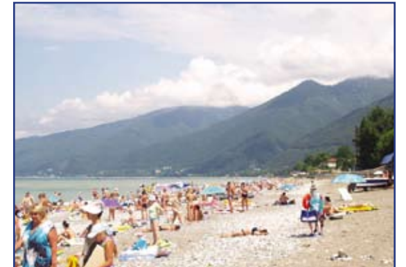
Tourists are again returning to enjoy Abkhazia’s sunny beaches and beautiful landscapes.

The support of PM/WRA has enabled The HALO Trust to achieve significant results in Abkhazia. Under the most recently completed contract, PM/WRA-funded teams found and destroyed 1,265 anti-personnel mines, 10 anti-vehicle mines, and 187 items of unexploded ordnance. A total of 2,491,614 square meters (616 acres) of mine-contaminated land was cleared and declared safe. In May of 2005, after seven years of demining, HALO completed operations in