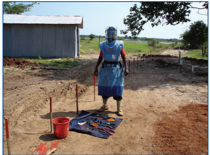
Quick Response Team Operational Site.

Thanks to the Rotary Clubs' efforts, 85 semi-finished houses have been constructed in Vilankulam and 25 families have started mov-