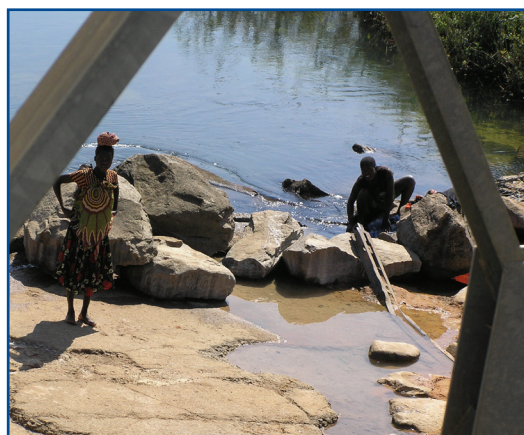
Local villagers wash clothes near the "Bridge of A Thousand Mines".

The Humpty Dumpty Institute (HDI), a non-profit organization established in 1998, has generated $770,000 from the sale of 500 metric tons of surplus dried milk obtained from the United States Department of Agriculture. These funds will be used for landmine clearance operations in the Planalto region of Angola, once the most fertile, and now the most densely mined, part of the country. The funds have been provided to The HALO Trust, a U.K.-based demining organization, to support HDI's Road Threat Reduction project in Angola. The project will help open up previously mined roads for more than 200 communities.