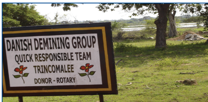
Danish Demining Group QRT releasing land for a small holder desperate to grow his own food.