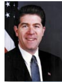
Message From the Special Representative

There are many Americans, and a large international community of people and organizations, who have dedicated tremendous effort to address this humanitarian crisis in recent years, and we respect and appreciate them all. As we carry out these policy and program initia-