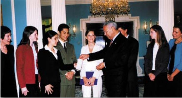
Secretary Powell thanks "Pennies for Peace."