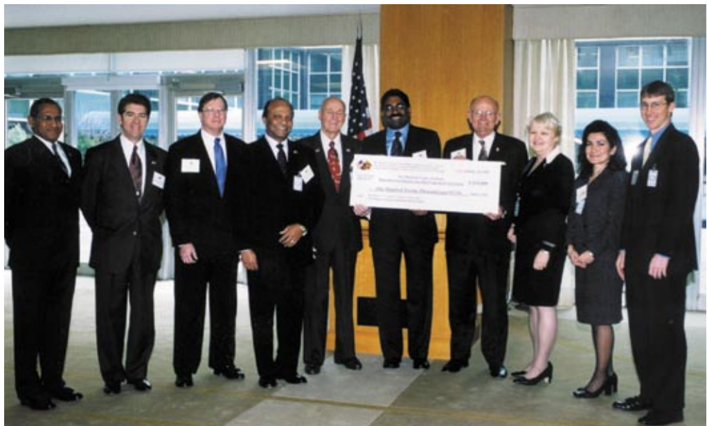
Marshall Legacy Institute presents Sri Lanka with $120,000 for the mine detection dog program.