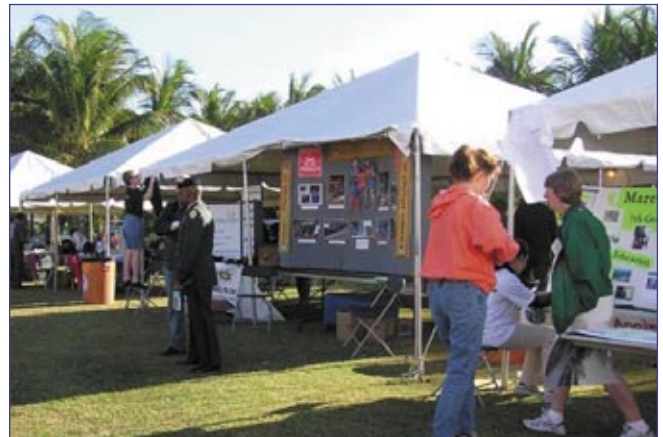
Mine Action partners' booths at the SFLAG Festival.