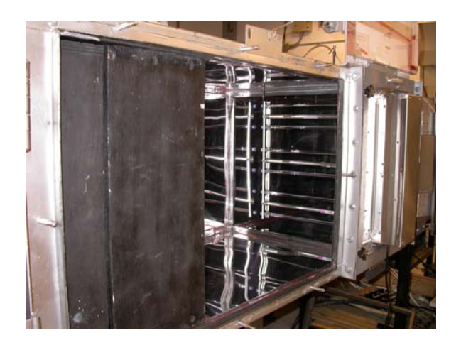
Figure 2-1. Ballast box installed on the outside of the test rig (on right). The device is also visible.