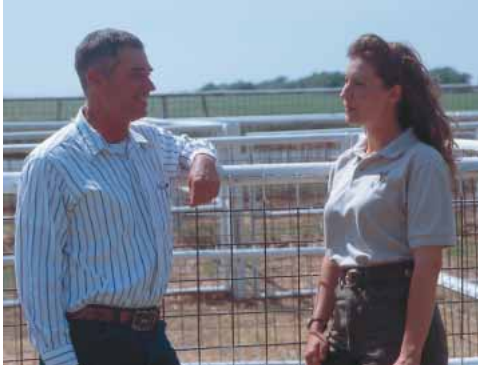
Service biologists work with landowners to conserve species on private lands.

Stewardship: the careful and responsible management of something entrusted to one's care.