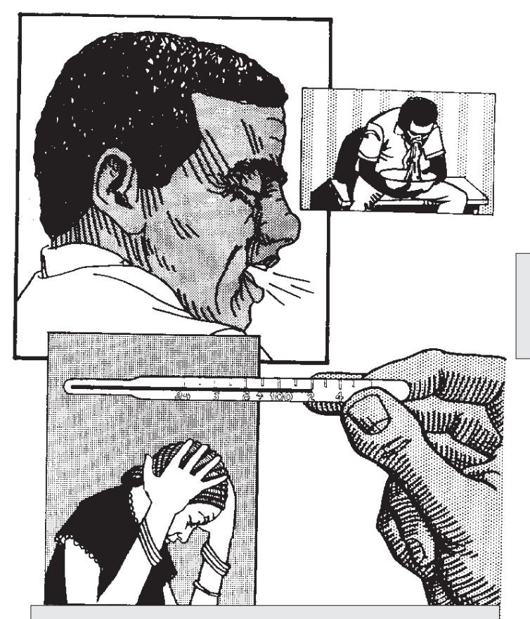
In addition to fever, Lassa fever patient may have: sore throat, back pain, cough, headache, red eyes, vomiting, or chest pain.