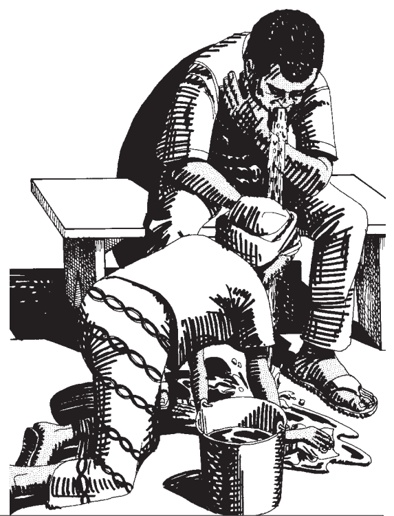
You can get Lassa fever by touching the blood, urine, or vomitus of another person with Lassa fever.