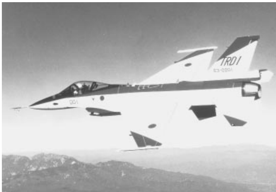
Figure 1: The F-2 Prototype

Shortly after the codevelopment agreements were signed, Congress became concerned about the merits of the agreements, especially the transfers of U.S. aerospace technology to Japan and the contributions this would make to the development of Japan's aerospace industry. Congress was also concerned about U.S. access to and the potential value of Japanese-developed technologies. As a result, we were tasked to periodically review the status of the program. Since November 1989, we have issued a number of reports dealing with the F-2 program. 4 In general, these reports concluded that during the development stage: