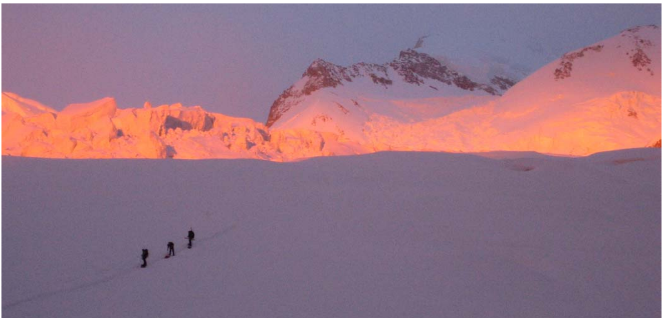
NPS patrol approaching the Great Icefall on the Muldrow Glacier

Denali National Park & Preserve's high altitude Lama helicopter crew and one climbing ranger were called across the Canadian border to assist in an interagency evacuation of three men stranded high on Mt. Logan in Kluane National Park. The three climbers, all suffering to varying degrees from exposure, altitude sickness, and frostbite, were caught in a sudden and severe storm at 18,000 feet near the mountain's summit. Lama pilot Jim Hood conducted three back-to-back high altitude shorthauls, ferrying the injured men to a lower elevation for an immediate military evacuation to an Anchorage hospital.