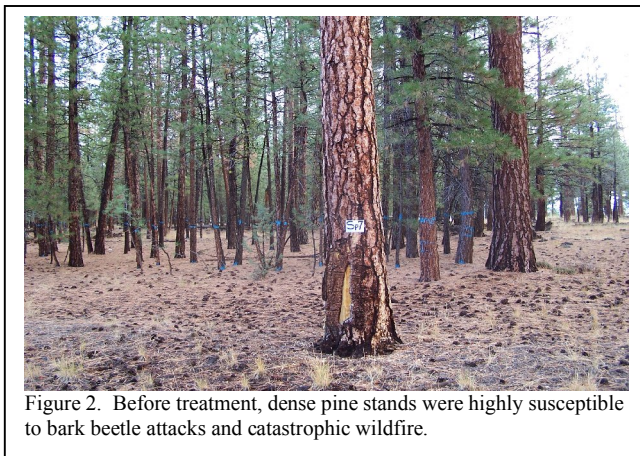
Figure 2. Before treatment, dense pine stands were highly susceptible to bark beetle attacks and catastrophic wildfire.