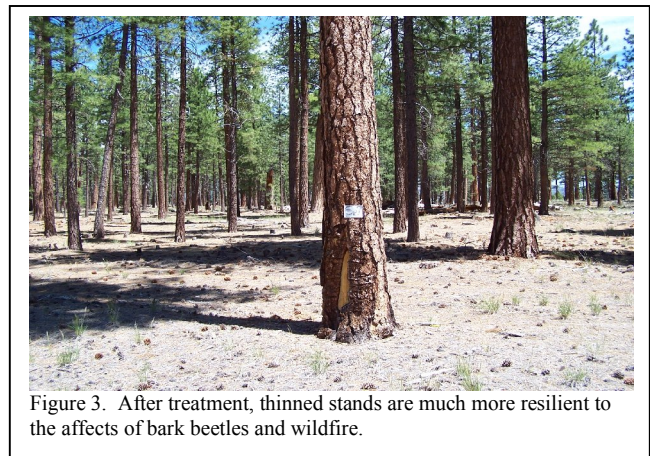
Figure 3. After treatment, thinned stands are much more resilient to the affects of bark beetles and wildfire.