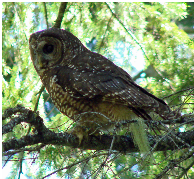
Northern Spotted Owl (Karl Vogel)

We are a diverse group of fish and wildlife biologists and ecologists with broad experience and expertise who specialize in the conservation of threatened and endangered species and marine mammals.