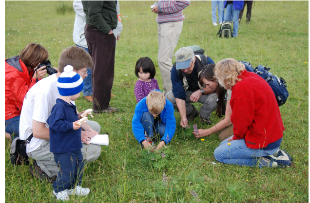
Learning about rare plant species in Washington's Boistfort Valley