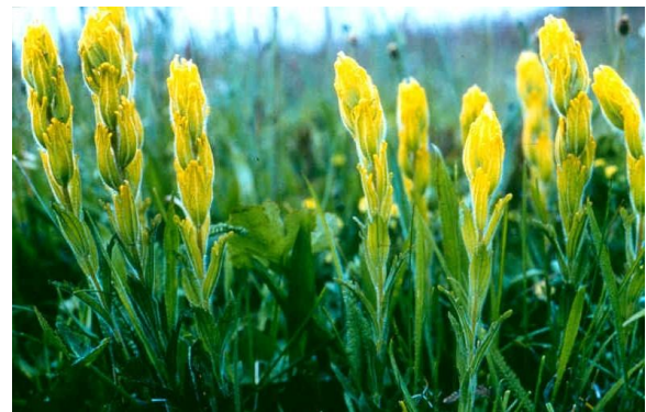
Golden paintbrush, a threatened species