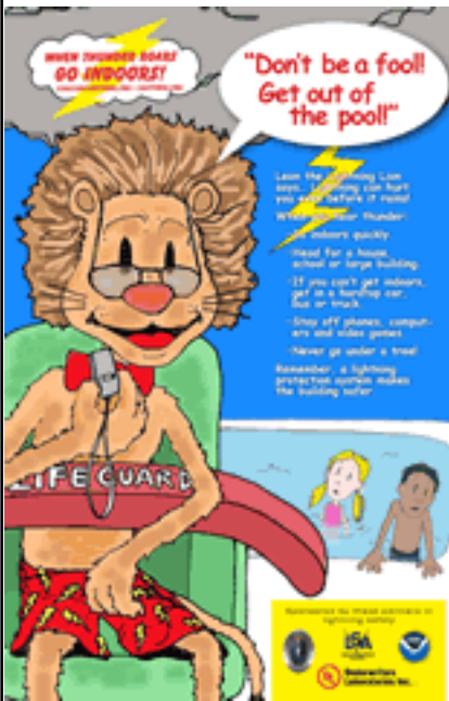
Leon the Lightning Lion offers safety tips via pool and soccer posters, stickers and Public Service Announcements.

Lightning Safety Week is the last full week of June, the start of the peak summer outdoor season when so many victims are struck. The campaign continues all year with continuous outreach efforts geared toward reducing the number of victims.