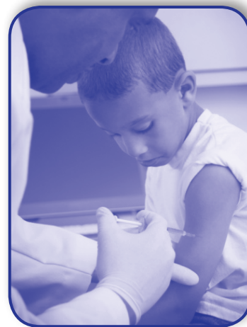
Young boy receiving allergy shot from his doctor.

Example: NIAID renewed the Hepatitis C Cooperative Research Centers program, which includes eight multidisciplinary, collaborative research centers conducting basic, animal model, and clinical research with an emphasis on translational research.