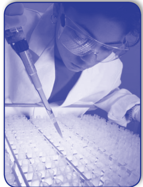
Bio-medical research laboratory assistant testing vaccine in response to Hepatitis C virus infection.

SCORE provides financial assistance to competitive research programs in all areas of biomedical and behavioral research. Funding is provided to develop biomedical research faculty members who are committed to improving competitive research programs and increasing the number of underrepresented minorities who are professionally engaged in biomedical