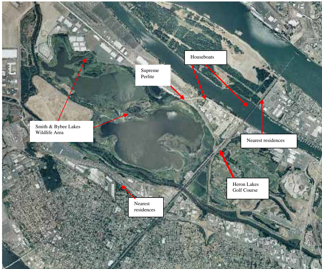
Figure 2 - Supreme Perlite vicinity

Supreme Perlite, managed by the current owner since the mid-1970s, was previously owned by his parents (now deceased) who purchased the plant in the early 1960s. According to the owner, there were 3 full-time employees (including the owner’s father) and a few part-time factory employees (generally seasonal and varying in number according to product demand) who worked at the plant during the years Libby vermiculite was processed at the plant. According to the owner, one of the employees who worked at Supreme Perlite for 34 years, and was reportedly a heavy smoker, died of lung cancer two years after retiring in 1988. Vermiculite was processed in the western section of the