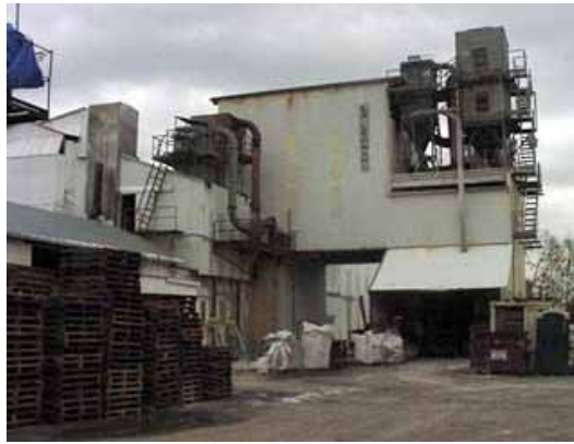
Figure 3 Former Vermiculite Unloading Area (April 2000)