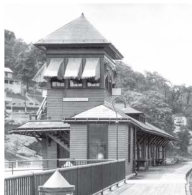
Station with tower at present location, circa 1931

The restoration project is expected to be completed in the fall of 2006.