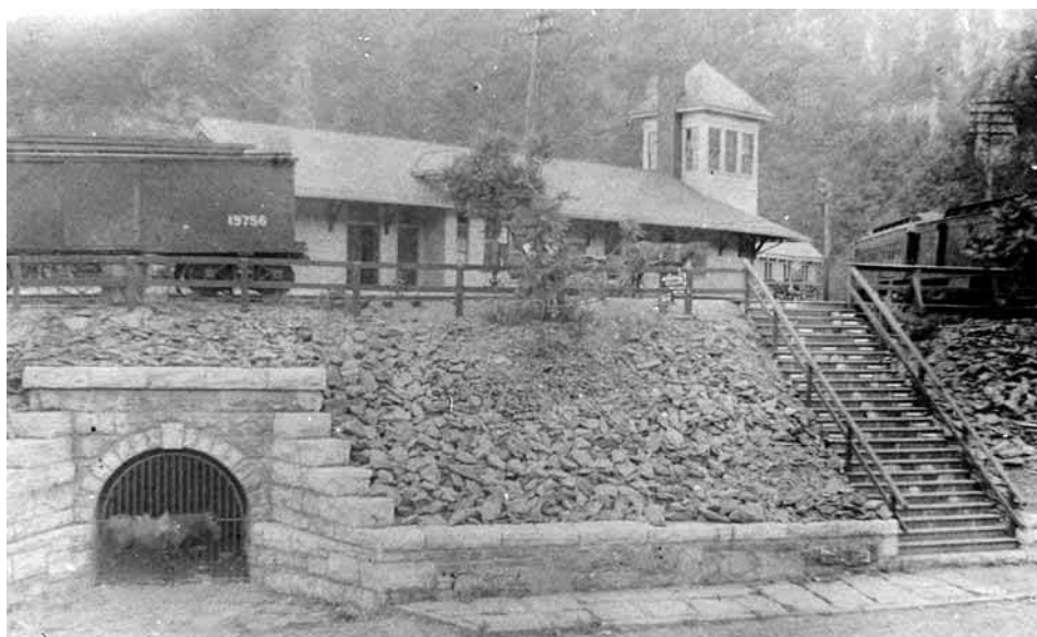
Harpers Ferry Train Station's original location, circa 1894-1900.