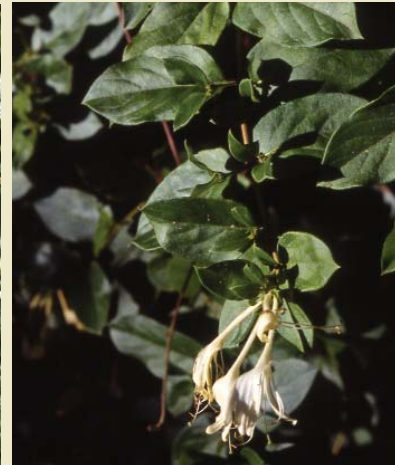
Japanese honeysuckle ( Lonicera japonica )