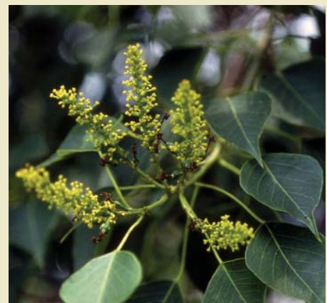
Chinese tallowtree ( Sapium sebiferum )