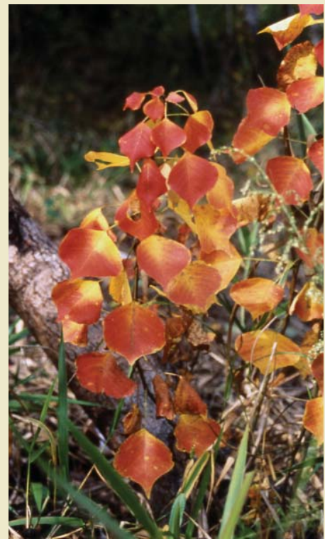
Chinese tallowtree ( Sapium sebiferum ) with fall foliage