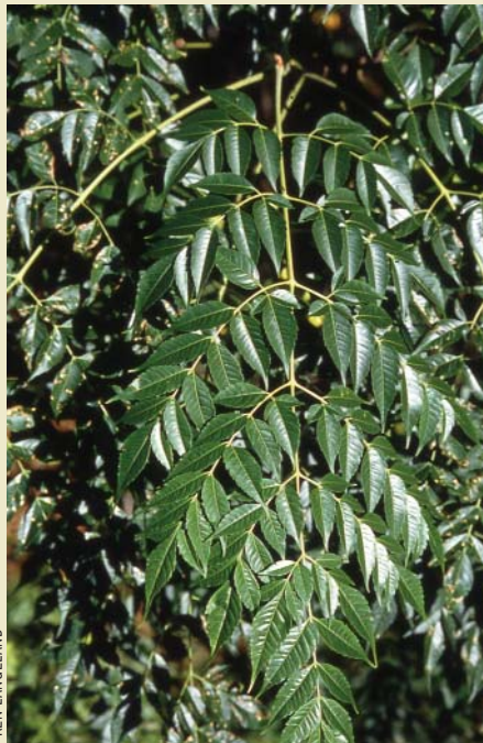
Chinaberry ( Melia azedarach )