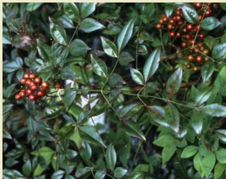
Nandina ( Nandina domestica )