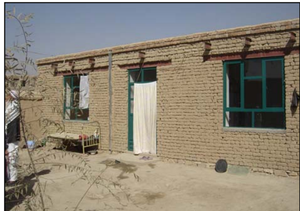
USAID/OFDA supported the construction of this and other seismic-resistant transitional shelters in Kabul.

The Kabul Area Shelter and Settlements (KASS) project is the largest recent shelter and settlements project to which USAID/OFDA has provided technical assistance. USAID/OFDA worked closely with USAID/Afghanistan, the Kabul Municipality, and implementing partner CARE to complete the multi-faceted project in October 2007. Working in selected districts of Kabul, USAID/OFDA provided shelter assistance to nearly 3,800 households, as well as latrines, potable water, drainage, gravel roads, livelihood generation projects, and training programs in health, sanitation, protection, and seismic hazard mitigation. The KASS project provides the humanitarian community with the first replicable model for large-scale, urban, and post-disaster shelter and settlement interventions, and is an example of how to address wide-scale urban shelter and service delivery challenges. In FY 2008, USAID/OFDA will build on the KASS experience by supporting a KASS-2 program featuring transitional shelter assistance to approximately 12,400 households in Kabul and assisting all residents in the project areas through the improvement of urban service infrastructure. The KASS-2 program will also feature a two-year capacity building project throughout the Kabul area.