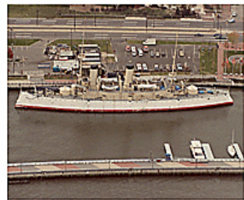
Large image (237939 Bytes)

Title: U.S.S. OLYMPIA at Penn's Landing in Philadelphia, 1977 ?