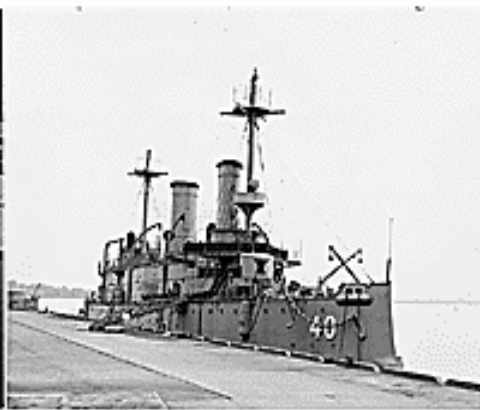
2 ARC Identifier: 279181. U.S.S. OLYMPIA , 1957