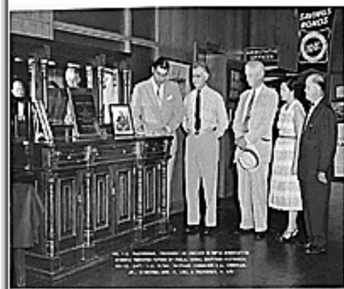
1 ARC Identifier: 279182. Transfer of OLYMPIA Relics to