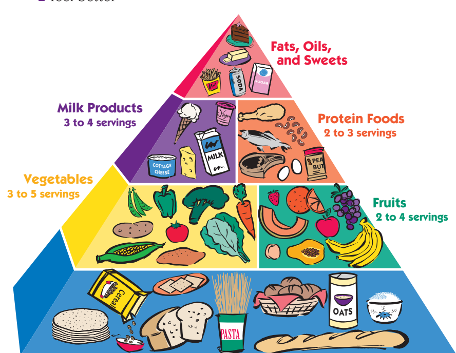
Breads, Grains and Cereals 6 to 11 servings