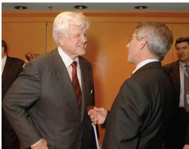
Figure 2 Senator Edward M. Kennedy speaking with the author on a visit to NIH in December 2006.