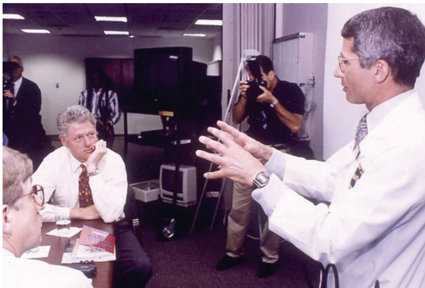
Figure 4 President Bill Clinton visits the NIH in 1995 and hears about the latest advances in HIV/AIDS research from the author. Next in line to update the President on the Human Genome Project is Francis S. Collins, MD, PhD, Director of the National Human Genome Research Institute, seated at the lower left.