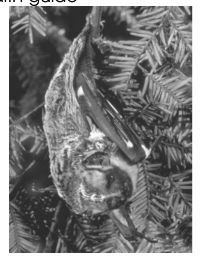
A male red bat