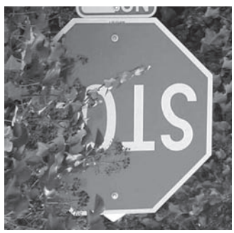
English Ivy Non-designated Noxious Weed

WHY IS THERE A LAW TO CONTROL NOXIOUS WEEDS? Noxious weeds affect everyone. Weeds do not obey property lines or jurisdictional boundaries. It takes a coordinated effort to prevent new noxious weeds from establishing and to control and eradicate the weeds already here. The noxious weed law provides a tool to quickly and effectively stop the spread of the new and most damaging weeds. WHICH WEEDS SHOULD BE CONTROLLED? To help protect people, resources and private lands, the Washington State Noxious Weed Control Board adopts a state weed list each year (WAC 16-750). * Noxious weeds are separated into classes A, B and C based on distribution, abundance, and level of threat (how dangerous the plant is to humans, animals, private and public lands, and native habitats). The goal is to prevent the spread of new and recently introduced weeds while it is still cost-effective. Class A weeds are the most limited in distribution and therefore the highest priority for control. Class B and C weeds vary in priority based on local distribution and impacts. Noxious weeds that are widespread in King County are called non-designated noxious weeds and control of these is recommended but not required.