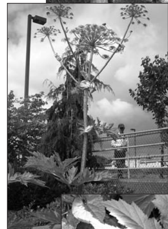
Giant Hogweed Class A Noxious Weed