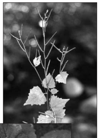
Garlic Mustard Class A Noxious Weed