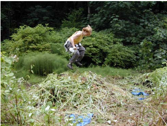
Policeman's helmet can be dried out and composted on site; however, plants with developing seed capsules should be bagged and put into the trash to prevent seeds from spreading.