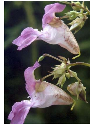
Don't be fooled: these pretty flowers belong to an invasive weed.

Chemical: Herbicides can be effective on large infestations of policeman's helmet where accessibility of equipment is limited. Using herbicides on isolated plants and small sites is not recommended since the plants are hollow-stemmed annuals that are easily pulled. Certain herbicides cannot be used in aquatic areas or their buffers. All aquatic herbicides are restricted-use herbicides. Purchase and application can only be done by licensed aquatic applicators. Should you determine that herbicides are allowable on the site, follow labels exactly as written. Products containing glyphosate (such as Roundup) are most effective if applied to actively growing plants. Glyphosate is absorbed by the growing leaves. However, glyphosate is "non-selective" and will injure any foliage that it comes in contact with, so make sure not to drip on desirable plants. Selective broadleaf herbicides with the active ingredient triclopyr, 2,4-D or metsulfuron work well for lawn or grasslands as they won't harm most grasses. When using this type of herbicide or one with glyphosate, do not cut down the treated plants until they have died completely. This can take two weeks or more. Chemical control options may differ for private, commercial and government agency users. For questions about herbicide use, contact the King County Noxious Weed Control Program.