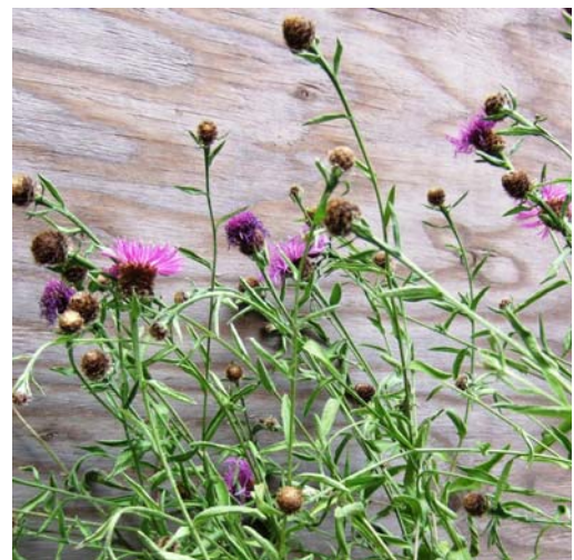
Once established, this weed is very difficult to remove.