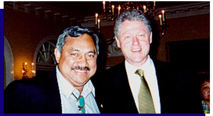
President Clinton and Congressman Faleomavaega during the recent meeting of the Asia Pacific Congressional Caucus held in the Oval Office of the White House.

Finally, the President is scheduled to attend a meeting of the leaders of the APEC nations next year in New Zealand. He has expressed a willingness to stop in American Samoa during the trip, and it would be the perfect time to renew this country's ties to the Pacific. Specifically, I raised with him the possibility of holding a Pacific summit at the East-West Center at the Univer-