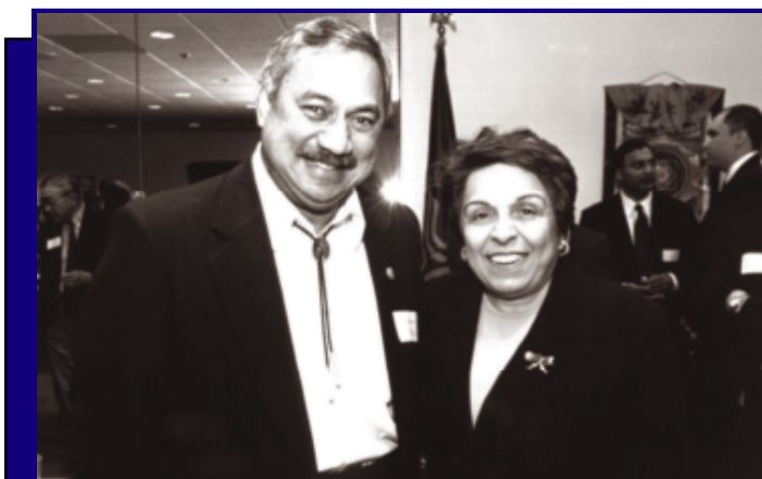
Congressman Faleomavaega and Secretary Donna E. Shalala of the HHS met and discussed the formation of the President's Advisory Commission on Asian and Pacific Islanders.