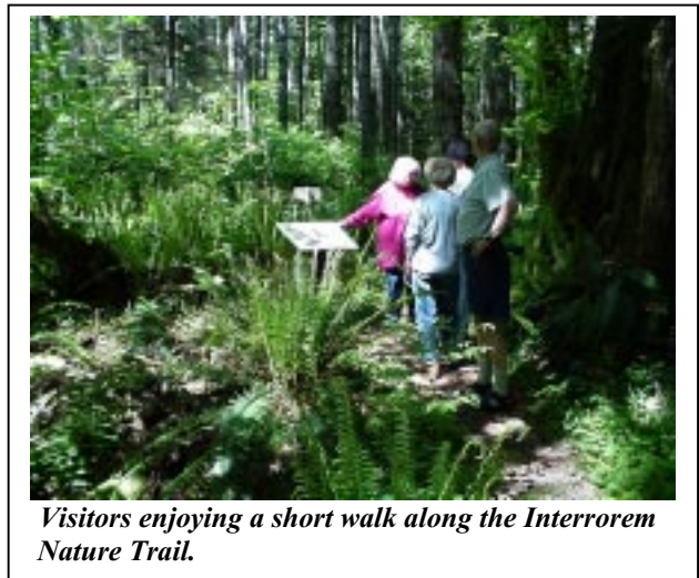
Visitors enjoying a short walk along the Interrorem Nature Trail.