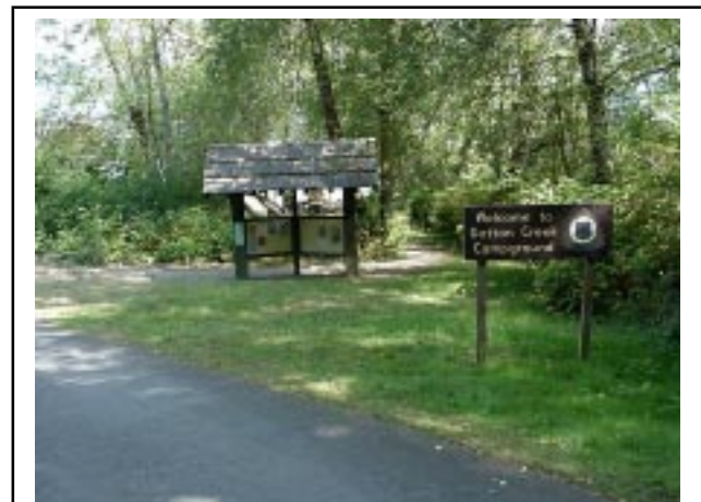
Gatton Creek Campground is located in the Quinault temperate rain forest on the south shore of Quinault Lake.

FACILITIES: The campground does not have potable water. A barrier-free toilet is available on site. There are 5 walk-in campsites that accommodate tents. There are also 3 picnic units. Parking lot will accommodate 10 self-contained RVs up to 24 feet in length (no tables or firerings). This site does not have a boat ramp. Boat ramps are located at Willaby and Falls Creek Campgrounds.