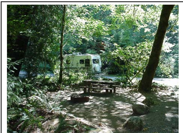
Falls Creek Campground is located in the Olympic temperate rain forest on the south shore of Quinault Lake.

PASS REQUIRED: A Northwest Forest Pass is required on all vehicles parked at most trailheads. $5 Day Pass & $30 Annual Pass are available at FS offices and vendors.