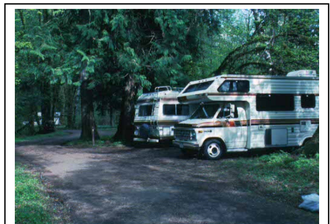
Campers enjoy a peaceful and shady campsite adjacent to the Hamma Hamma River.

Maximum stay is 14 days. Pets must be leashed. Season lasts from May 1-September 30.