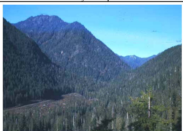
LeBar Horse Camp is located in the South Fork Skokomish drainage.

SETTING: This stock campground is located across the road from the trailhead to the Lower South Fork Skokomish River Trail #873. Large evergreen conifers and hardwoods provide lots of shade at this campground. Trail register at trailhead—please sign in and out.