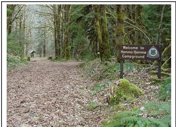
The Hamma Hamma Campground is located in a mixed stand of bigleaf maples, grand fir, western hemlock and Douglas-fir.

SETTING: Campground is located along the shore of the Hamma Hamma River. Evergreen conifers and hardwoods provide lots of shade.