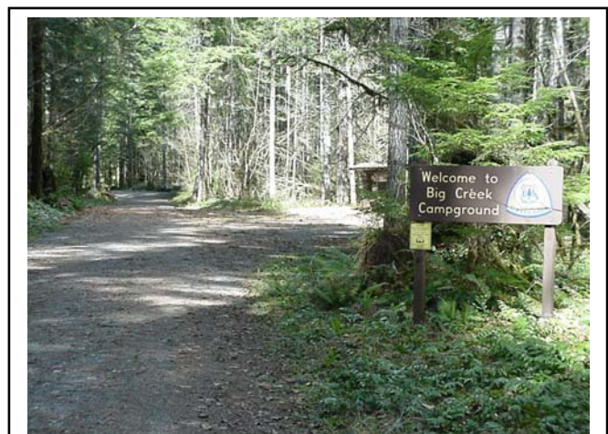
Big Creek Campground provides secluded camp units in a second-growth conifer stand near Lake Cushman.

OPPORTUNITIES: Hiking, mountain climbing, fishing, swimming, and exceptional scenery can be enjoyed in the area. Two loop nature trails start in the campground, lower loop 1.1 mile, upper loop 4.3 miles. A covered picnic shelter is available for group –day use only. Fires only in developed campsites.