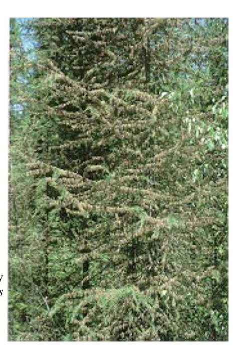
Larch needles killed by H. laricis