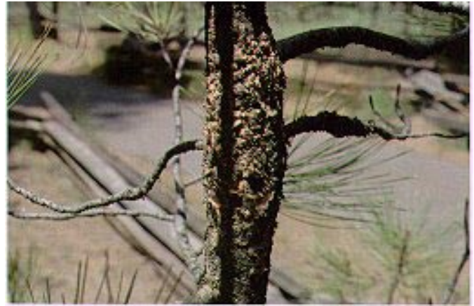
Typical comandra rust infection with aecia on sapling pine

May be Confused With: Insect attack, animal damage, dwarf mistletoe, environmental damage.