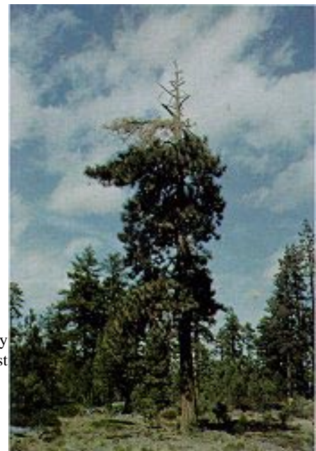
Dead top caused by comandra rust