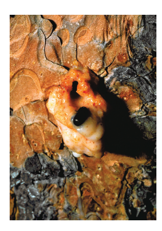
Figure 6: Not all pitch tubes indicate successful attacks. Note the beetle trapped in this large pitch tube. If the majority of tubes look like this, the tree may have survived the current year's attack.