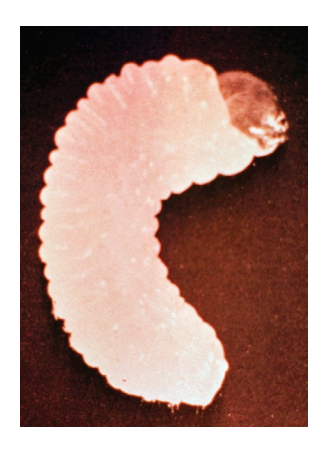
Figure 5: Larva of MPB (actual size, 1/8 to 1/4 inch). They are found under the bark in tunnels.