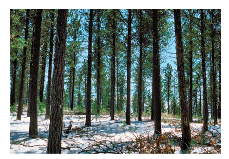
Figure 11: The appearance of a forest thinned to help prevent MPB. This can also improve mountain views and reduce fire hazard.