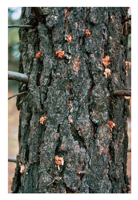
Figure 2: "Pitch tubes" indicating trunk attacks by MPB. Success of the attacks is confirmed by looking under the bark with a hatchet for beetles, their tunnels and/or bluestaining.