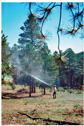
Figure 10: Large, uninfested pine being preventively sprayed. This protects high-value trees and should be done annually between April 1 and July 1.