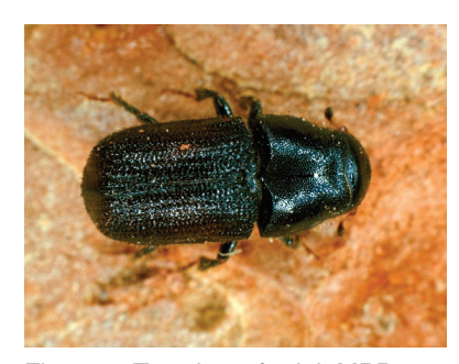
Figure 3: Top view of adult MPB (actual size, 1/8 to 1/3 inch).

Mountain pine beetle has a oneyear life cycle in Colorado. In late summer, adults leave the dead, yellow- to red-needled trees in which they developed. In general, females seek out large diameter, living, green trees that they attack by tunneling under the bark. However, under epidemic or outbreak conditions, small diameter trees may also be infested. Coordinated mass attacks by many beetles are common. If successful, each beetle pair mates, forms a vertical tunnel (egg