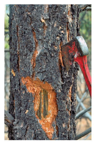
Figure 7: Checking beneath the bark for MPB. This attack was successful (note tunnels and stain).