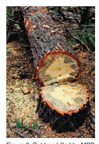
Figure 9: Cut tree killed by MPB, showing the characteristic bluestaining pattern.