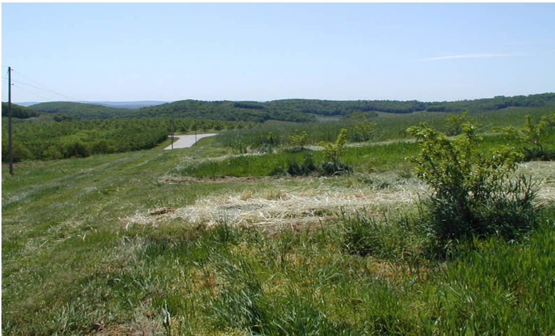
Figure 5. Root sprouts after tree removal.

A sentinel tree program was begun in 2002 as a warning system for PPV in quarantine zones. The sentinel trees are highly susceptible trees to PPV and are useful for detection since many of the Prunus trees in a quarantine zone have been removed. By 2005, 197 sites with over 500 sentinel trees were established in critical PPV areas. Each tree is sampled twice a year and to date all sentinel trees have tested negative to PPV. In a related effort, regrowth root sprouts from removed trees and seedlings at stone fruit dump sites have been sampled, tested and found negative for PPV.