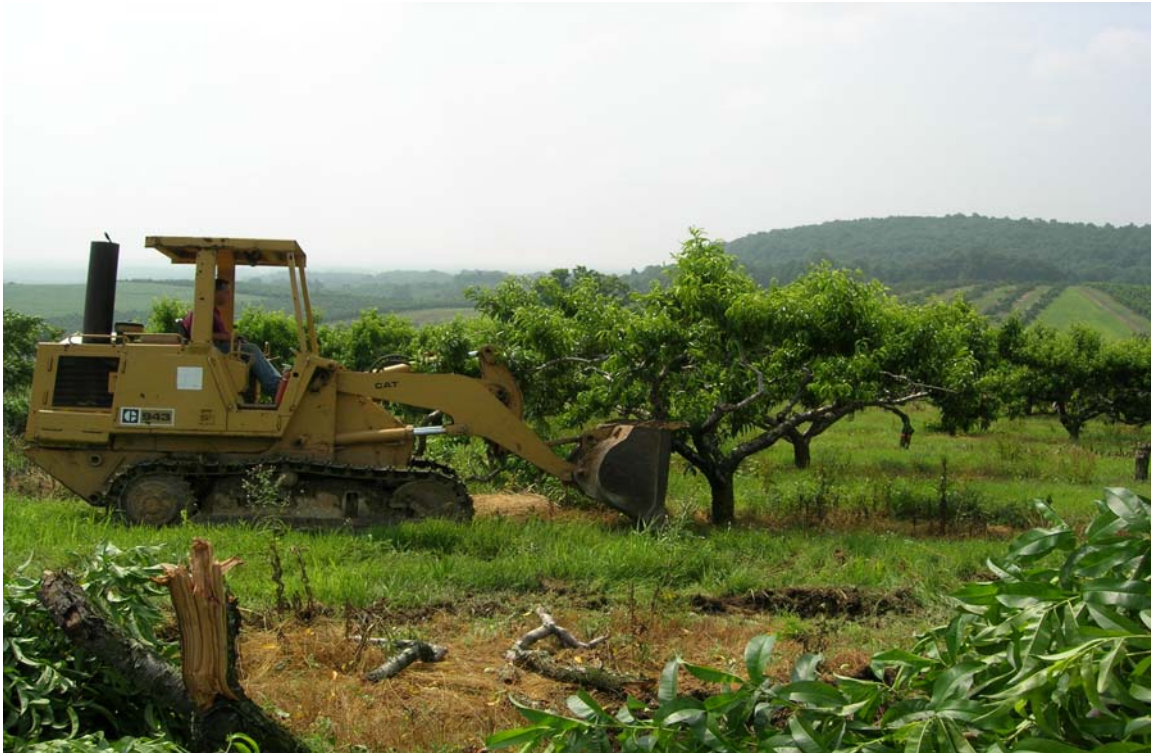
Figure 4. Removal of Prunus trees.

stone fruit seedling or vegetative plant material from the area. When PPV-infected trees for PPV were found it required the removal of whole orchard blocks as well as residential and wild Prunus trees.