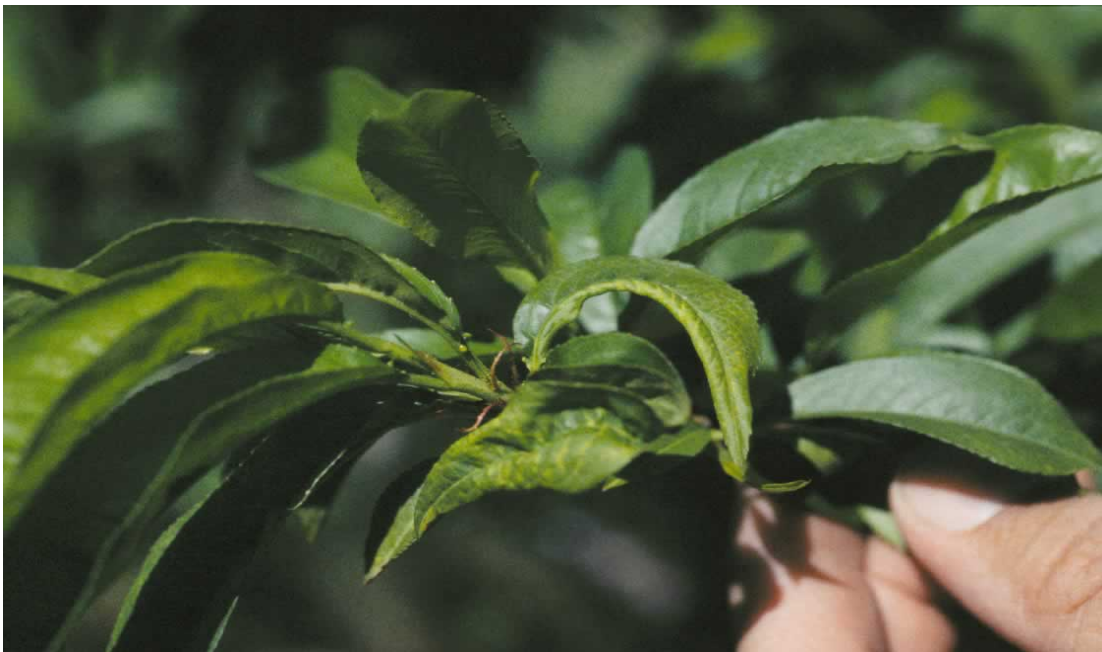
Figure 2. Leaves with yellow netting and distortion caused by PPV.

Leaves. Several types of symptoms may occur on leaves. PPV may cause leaves to have faint light green to yellow ring spots or halos about the size of a pencil eraser or smaller scattered across the leaf. Leaves may also exhibit a yellow netting pattern which is often accompanied by veins that are lighter green than normal to yellow in color. Leaves may be distorted or twisted as a result of infection.