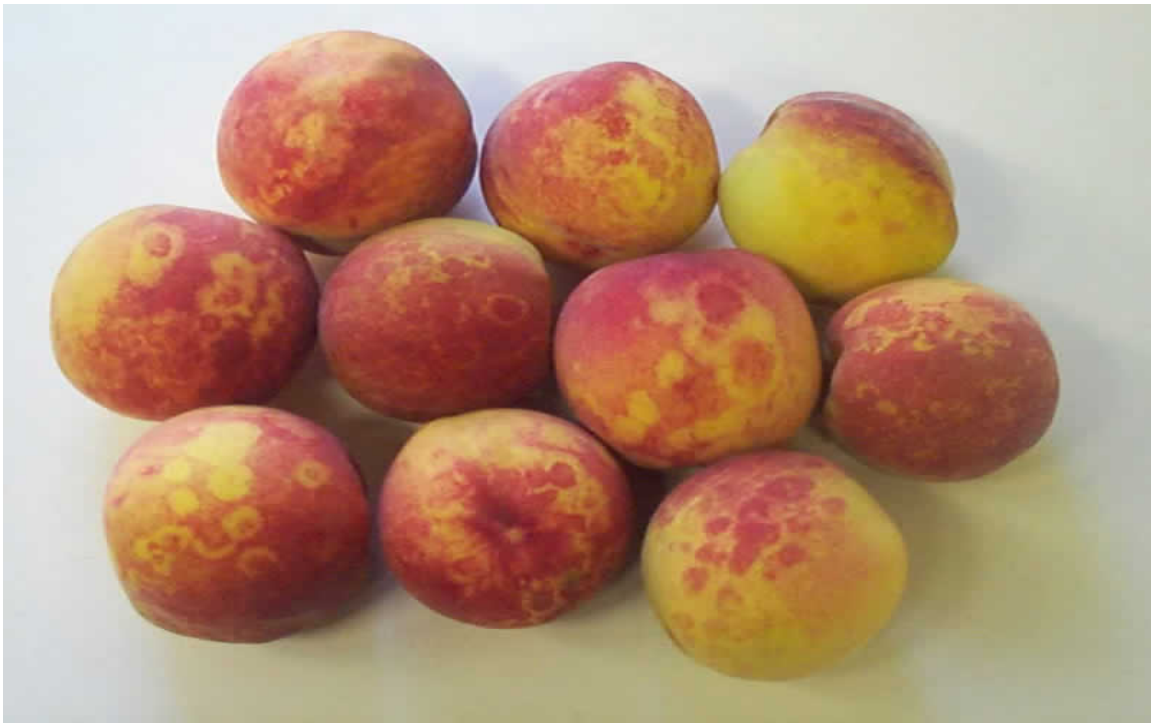
Figure 3. Yellow halos and ring spots on peach fruit caused by PPV.

Fruit. While the blossom and leaf symptoms can be easily missed, it was the bold yellow ring spots on the red skins of peach fruit of the cultivar Encore that first made the PA fruit grower who found PPV aware that there was an unusual and serious problem with his fruit. Some stone fruit cultivars show no symptoms after infection while others like Encore peach display pronounced PPV symptoms about 3 years after the tree is infected. At first only a few fruit show the symptoms but eventually nearly all the fruit on the tree are spotted and the symptoms become easier to see as the fruit ripens.