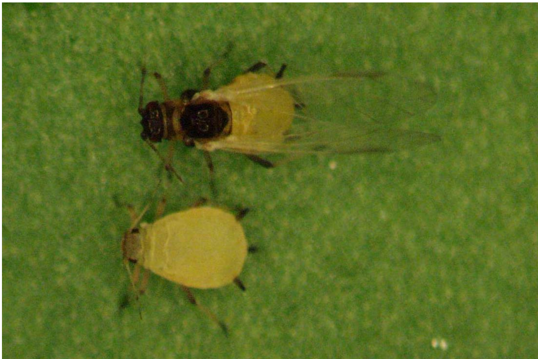
Figure 6. Aphid, Aphis spiraecola , common vector of PPV.

Monitoring of aphid populations has been conducted in commercial orchards, residential properties and in sentinel trees beginning in 2000 and continuing through 2006. The project objectives are to identify potential aphid vectors of PPV and determine seasonal variation. In summary, 29 different species of aphids were identified with the fewest number of aphid species occurring in commercial Prunus orchards as a result of effective pest management programs. Higher numbers of aphid species were collected on sentinel trees which receive less intense pest management than commercial orchards. Because of higher aphid numbers, the sentinel trees may serve their intended purpose and be the first indicators of PPV resurgence or reintroduction into the area. The peak time for aphid species collection in commercial orchard occurs in late June and July. Aphis spiraecola , (picture below) the aphid species assumed to be the most significant vector of PPV in PA due to its prevalence in orchards during the growing season and its efficiency as a vector.