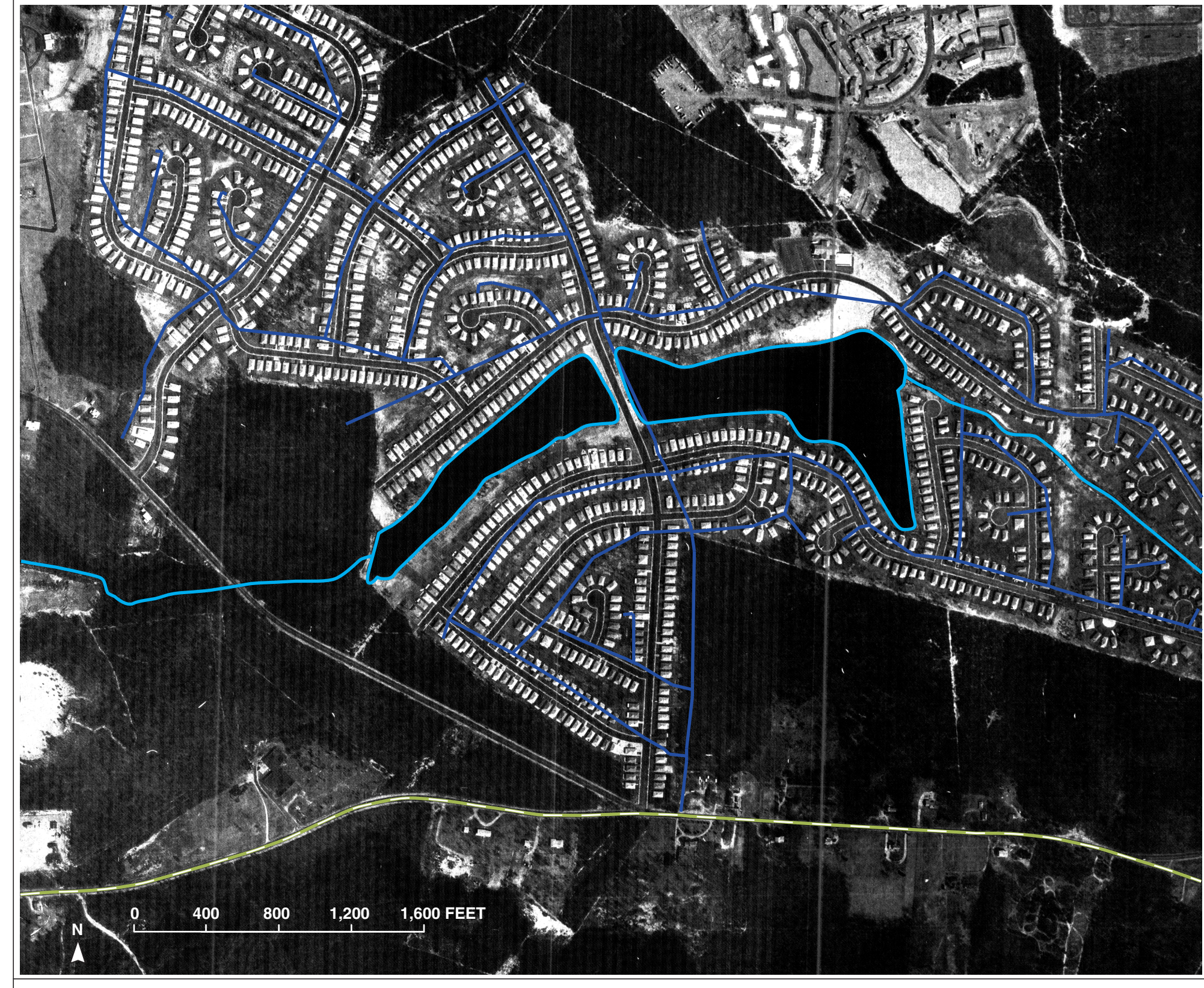
PLATE 43. AERIAL PHOTOGRAPH DSG-63 SHOWING RESIDENCES AND BUILDINGS SERVICED BY THE WATER-DISTRIBUTION SYSTEM, NORTHERN DOVER TOWNSHIP AREA, NEW JERSEY, APRIL 1972