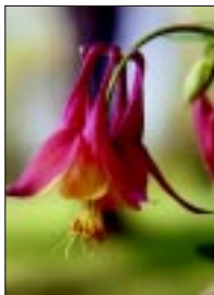
Columbine