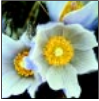
Pasque flowers