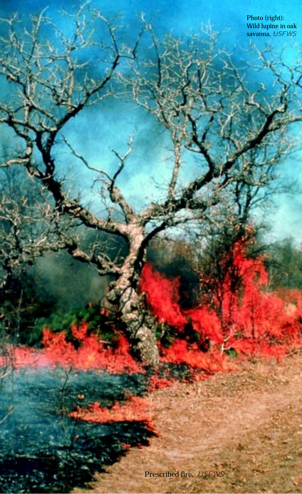
Prescribed fire, USFWS

The majority of the refuge is designated a wildlife sanctuary and closed to all public access from March 1 to August 31 to allow wildlife to breed and raise their young free from human disturbance. During the sanctuary period, the Blue Hill and Mahnomen hiking trails, the wildlife drive, the St. Francis River canoe route, and fishing access points remain open for public use.