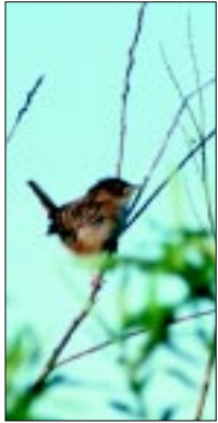
Sedge wren

Located near Little Falls, MN, this refuge is managed as part of the Sherburne complex. Established in 1992 to protect and restore wetlands and enhance waterfowl, and other migratory bird habitat, Crane Meadows is currently in the land acquisition stage of development. At this time only limited facilities are available. Visitors are invited to experience the refuge from the scenic, 3 mile, Platte River Hiking Trail. The trailhead is located 4.5 miles east of U.S. Highway 10 on County Road 35, just south of Little Falls, MN.