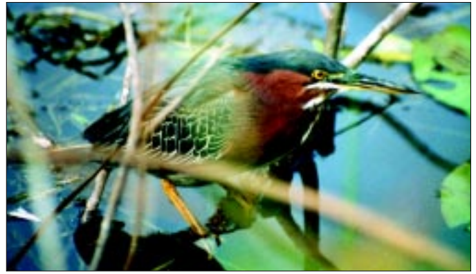
Green heron, N. Haugen, USFWS