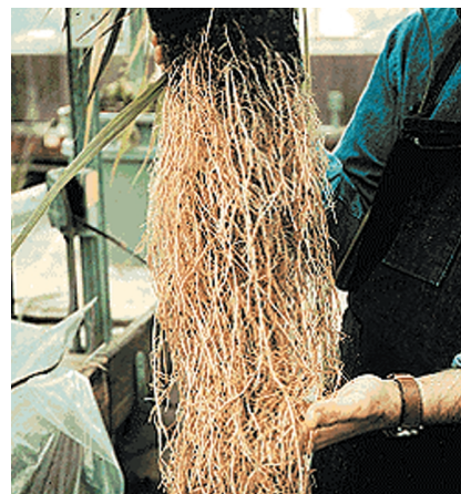
Figure 3. Phytoextraction by whole plant harvesting.

A number of patents regarding specific plants and processes have been awarded to various companies that specialize in phytoextraction.