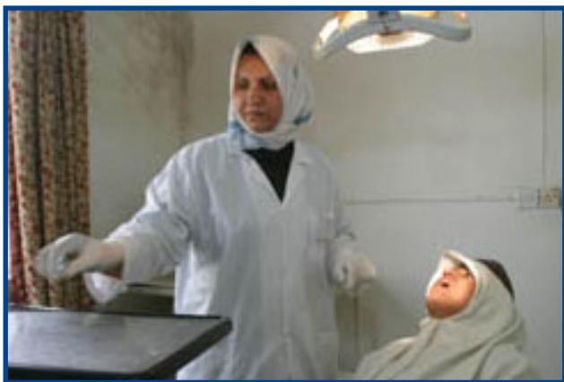
Above: Dental care at a primary health care center in the Al-Kargh district of Baghdad, Iraq.