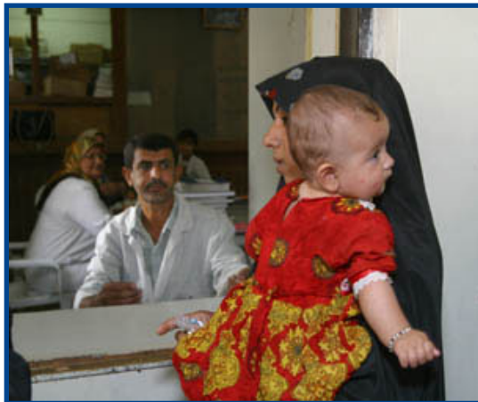
Left: An Iraqi woman and child receive drugs from a primary health care center in the Al-Kargh district of Baghdad, Iraq.

USAID's work in the health sector is guided by fundamental principles: