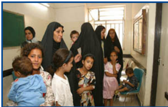
Iraqi women and children wait to see a doctor at a primary health care center in the Al-Kargh district of Baghdad.