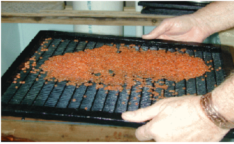
Trout eggs on screen just before being put down in tank

Open to the public, Jackson NFH welcomes visitors to the hatchery for a closeup view of the fish production process. With over 75,000 visitors annually, the public is invited to explore the self-guided outer hatchery raceways. The Service is currently working on rebuilding the hatchery and hopes to have a new facility and visitor services open to the public in 3 to 5 years.