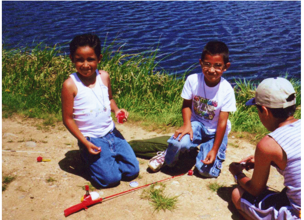
Enjoying National Fishing and Boating Day events; USFWS

Jackson NFH is located 4 miles north of Jackson on the National Elk Refuge. Join the hatchery staff as they participate in local public fishing festivities for National Fishing and Boating Day events in June. Come prepared for a day of fun!