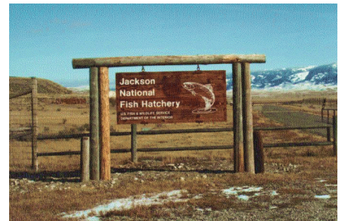
Welcome to Jackson National Fish Hatchery

Jackson NFH provides many exciting visitor opportunities at the hatchery and surrounding refuge area.