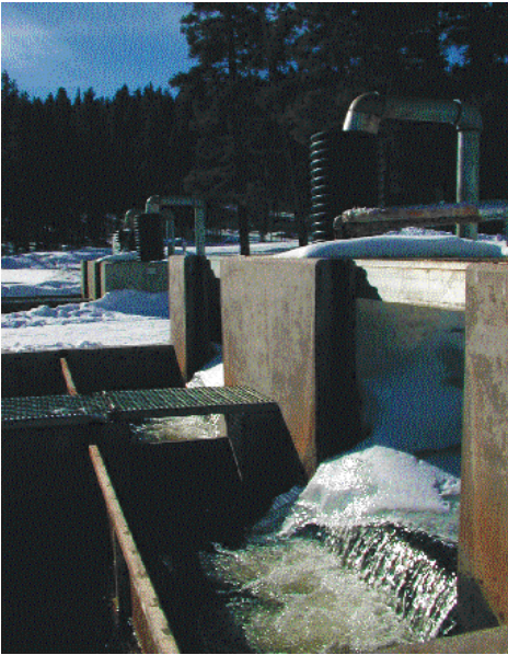
Leadville NFH Raceway; USFWS