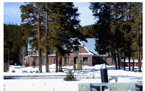
Historic Leadville Hatchery Building

Over 55,000 angler days of recreational fishing in Colorado valued at over $2,740,000 are a result of the stocking efforts!