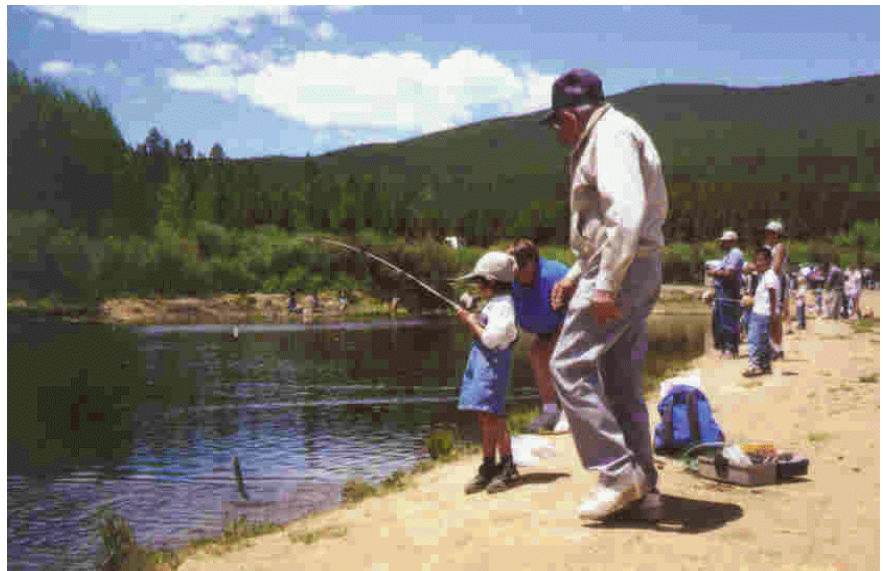
Annual Children's Fishing Day

Leadville NFH is located 6 miles southwest of the city of Leadville along Highway 300. Come prepared for a day of fun!