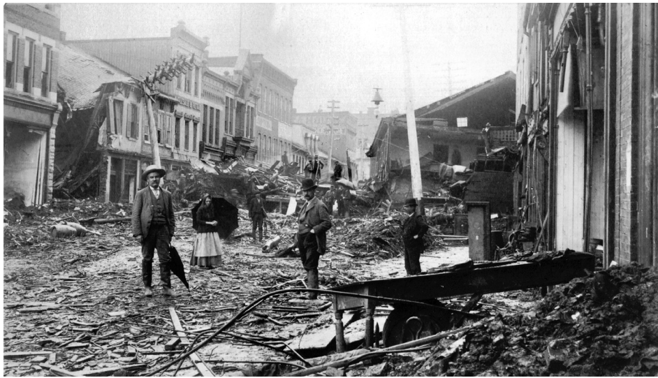
Aftermath of the Johnstown Flood