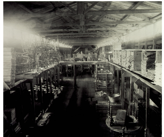
Supply warehouse at site of Johnstown Flood