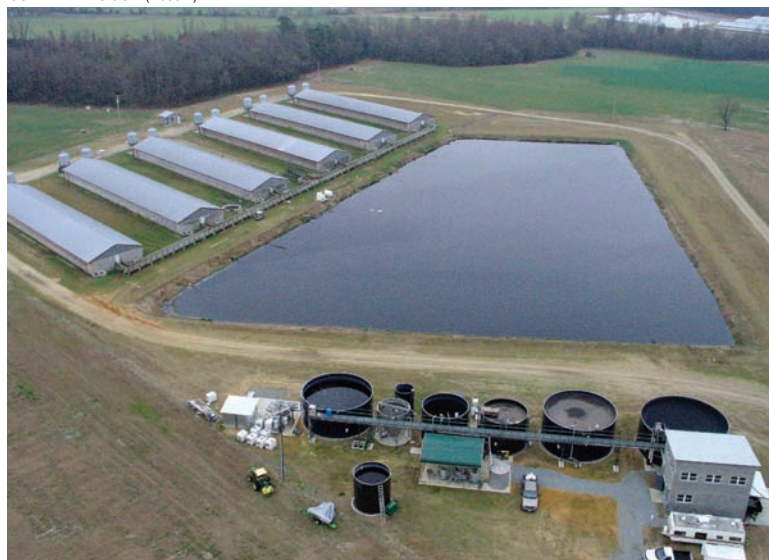
In Duplin County, North Carolina, a full-scale wastewater treatment system (foreground) that replaced the swine lagoon.