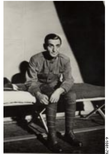
At Camp Upton during World War II, Irving Berlin wrote and performed in This Is The Army .

A series of eight postcards (pictured) of Camp Upton's grounds and soldiers — including its most famous, songwriter Irving Berlin — is now on sale in the BERA Sales Office, Berkner Hall, weekdays, 9 a.m.-3 p.m.