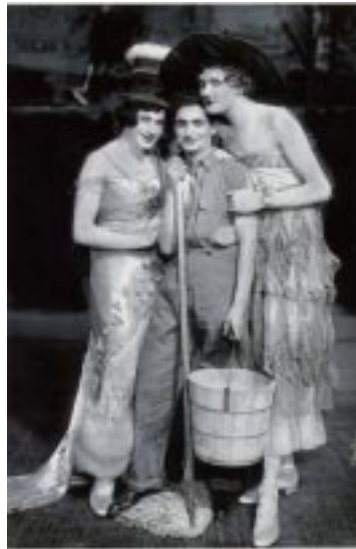
Sergeant songwriter Irving Berlin (center) and two "beauties" in drag, star in Yip! Yip! Yaphank .

BNL sits on what was the U.S. Army's Camp Upton, a World War I training center and a World War II induction center and rehabilitation hospital. Camp Upton was named for Emery Upton, a Civil War general and commandant of the U.S. Military Academy at West Point.