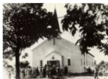
The Camp Upton chapel during World War II, now the home of the Camp Upton Historical Collection.