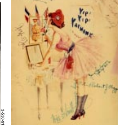
The cover of Yip! Yip! Yaphank program, signed by Irving Berlin.

During World War I, Irving Berlin's hit song "Oh! How I Hate to Get Up in the Morning" was inspired by Camp Upton scenes such as this.