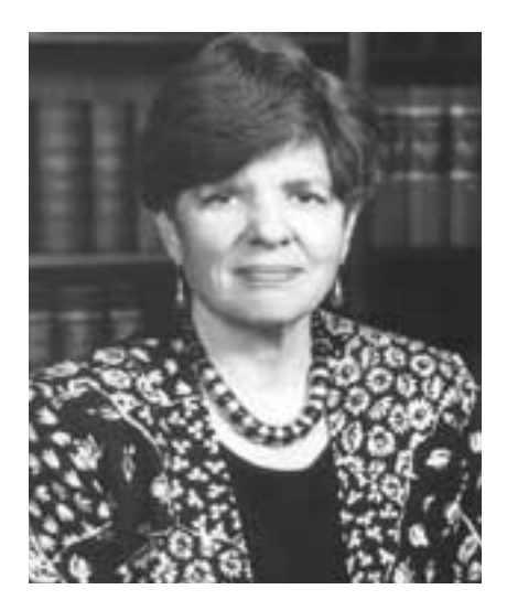
Alice M. Rivlin

Rivlin. The basic thesis of the book is that we need a clearer division of labor between the central government and the states and localities, in part to clarify in citizens' minds where the responsibility lies and which level of government they should hold accountable. That's gotten very confused in the public mind because lots of powers have been moving to Washington.