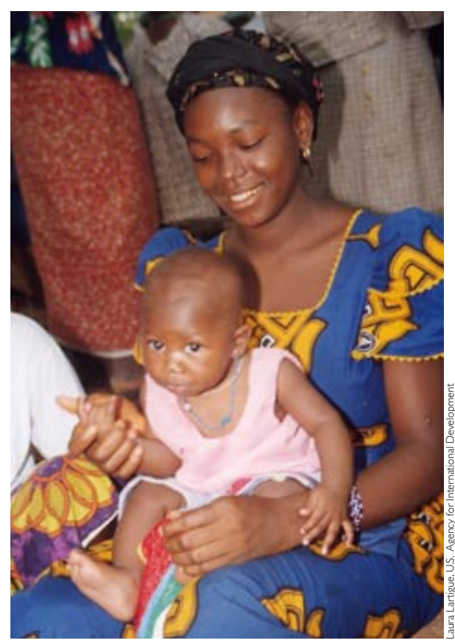
A Guinean mother and child.

jobs. Working with various organizations, donors, and technical bodies, JHPIEGO, through the Maternal and Neonatal Health program, was a key contributor in the development of the World Health Organization manual Managing Complications in Pregnancy and Childbirth . This document has been translated into 16 languages—including Spanish, French, Laotian, Bahasa, and Mandarin—and is now standard text in 40 medical schools. It has been used to inform policy dialogue and contribute to the development of national standards across Africa, Asia, and Latin America. Thus, governments around the world have a guide to evidence-based lifesaving practices, and health care providers have a manual that tells them how to manage the complications that arise in pregnancy and childbirth.