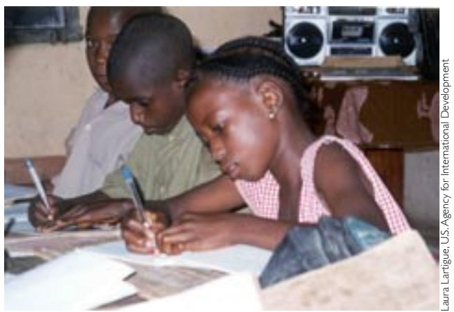
Guinean children participate in a lesson.

Although Guinea remains plagued by a shortage of teachers and classroom materials, there are signs for optimism. According to the education ministry, during the 2003-2004 school year, the percentage of school-aged children attending primary school grew from 74 percent