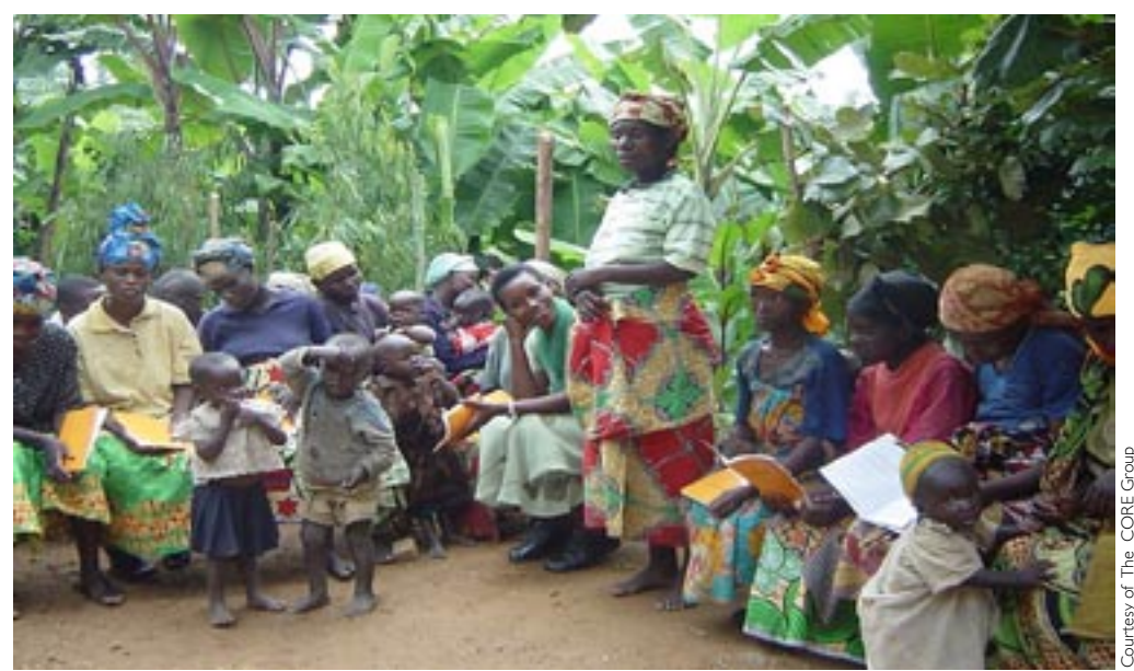
Mothers and children being trained through the antimalarial program in Rwanda.

Nongovernmental organizations (NGOs) are playing a critical role in helping countries move toward those development goals that seek significant reductions in child and maternal mortality and progress in combating HIV/AIDS, malaria, and other major diseases. In Rwanda, three NGOs have teamed with the national government to introduce effective community-based care for malaria.