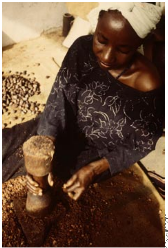
Women in Boulgou process and sell karité (shea) butter as part of a Lutheran World Relief project. Their small business gives them a way to support their families and participate in their communities.