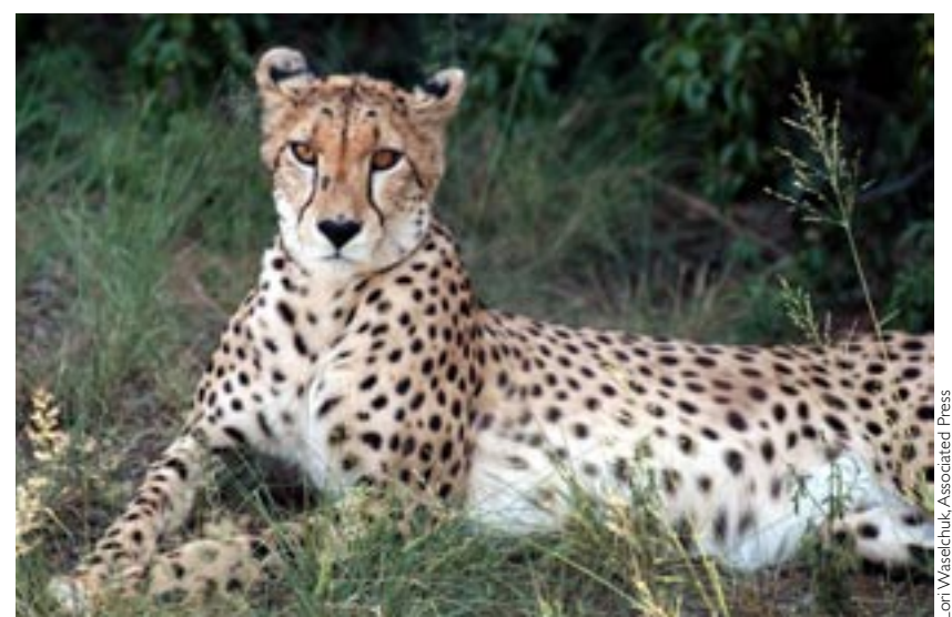
A cheetah rests in the shade in southern Africa.

Conservancies earn significant income by entering into joint ventures with private investors to establish safari lodges or by negotiating trophy-hunting concession agreements. Individual members also earn money from making and selling arts and crafts. Except for such personal income, the earnings of the conservancies are pooled. A portion of the conservancy income goes toward community projects such as schools, clinics, and roads. For example, in 2003, Torra Conservancy contributed more than $2,000 toward the renovation of their local school and bought a photocopier for the school. It also contributed about $1,000 to their local crèche-a day nursery. In 2003, Khoadi Hoas Conservancy contributed more than $3,000 to their two local schools and provided diesel fuel to farmers to pump water for their own livestock and for elephants. In 2004, Nyae Nyae Conservancy provided funds for waterpoints maintenance and protection against elephants, in order to secure water for both human and wildlife consumption. The remaining funds in these accounts generally were distributed to the individual residents as a dividend of conservancy membership.