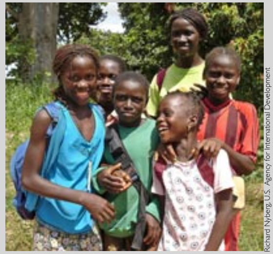
Young Senegalese students.

The education corps includes a vibrant teachers association and a parent-teacher association (PTA) that provide important opportunities for dialogue and sharing of skills and ideas. The corps developed an education action plan that outlines practical actions to improve schools and educational quality, such as parent involvement and public education campaigns. With this comprehensive plan in hand, the rural council has also found it easier to approach government and donor partners for assistance.