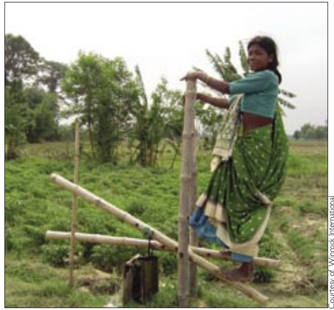
A woman operates a bamboo treadle pump in Nepal.

The Nepal SIMI project promotes micro-irrigation to help subsistence farmers escape poverty. This program helps develop supply chains to build the capacity of equipment manufacturers, dealers, and installers, as well as seed and fertilizer suppliers. Through local social mobilization programs, SIMI is increasing farmers' awareness of new opportunities and enabling them to increase their links to appropriate markets.