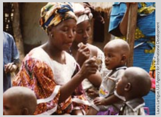
Women feeding children.

Results in the southern region of Ethiopia are already visible. The level of child immunizations increased from 54 percent in 2003 to 74 percent in 2004. Pit latrine coverage has increased, as has the use of contraception.