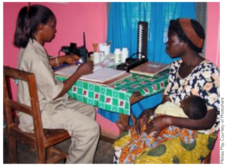
A mother and her infant visit a health nurse in West Africa.

Management Sciences for Health and Save the Children, has supported Afghanistan's Ministry of Health in developing a two-year midwifery curriculum and program that includes classroom studies and clinical work at area hospitals. To date, midwifery schools have been established in Herat, Mazar As-Shariif, Jalalabad, Kandahar, Kabul, Badakshan, Bamiyan, Jawzjan, Khost, and Takhar, and two classes have already graduated. This program will produce 299 new midwives in 2005, a 64 percent increase over the number of trained midwives in Afghanistan when the Taliban fell.