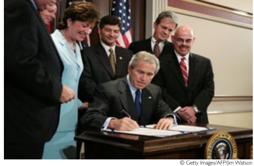
President George W. Bush signs the Federal Funding Accountability and Transparency Act of 2006 in front of members of Congress on September 16, 2006, in Washington, D.C. The bill requires the creation of a searchable online database of all government contracts.

The opinions expressed in this article do not necessarily reflect the views or policies of the U.S. government.