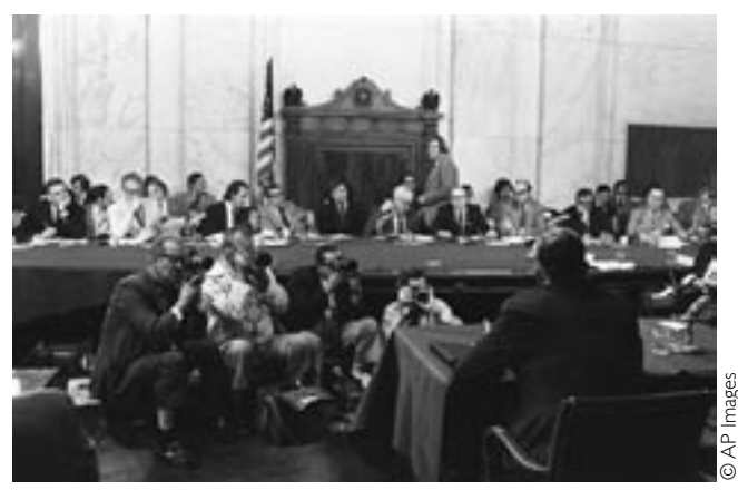
A general view of the Senate Watergate Committee hearings on August 3, 1973. The Watergate Committee discovered evidence that eventually forced U.S. President Richard Nixon to resign from office.

It is impossible, of course, to eliminate corruption. There are many opportunities for steering public processes in ways that distort public purposes for private gain, and it is impossible to eliminate it by rule. But, as the American approach of the 1970s suggested, it might be possible to reduce it by opening up government's doors, by shining a bright light inside, and by empowering investigators to examine government closely to weed out waste, fraud, and abuse. This approach has deep roots in American political tradition, and it echoes what James Madison, fourth president of the United States, wrote in 1822: "A popular Government without popular information or the means of acquiring it, is but a Prologue to a Farce or a Tragedy or perhaps both. Knowledge will forever govern ignorance, and a people who mean to be their own Governors, must arm themselves with the power knowledge gives."