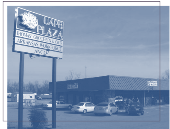
Thomas Grocery and Gifts exemplifies the University's use of HBCU funds in supporting the economic development of its community.

Located in UAPB Plaza, Thomas Grocery and Gifts officially opened its doors in December 2004. The new grocery fills a void in basic services that existed in the neighborhood for over two decades. The business was seeded using HBCU funds and matched with private capital from the owners.