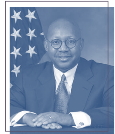
HUD Secretary Alphonso Jackson

In addition, funding applicants can now earn a higher score in the grant evaluation process if they respond to questions on their local regulatory environment and demonstrate successful reform efforts within their jurisdictions. Secretary Jackson has announced an Affordable Communities