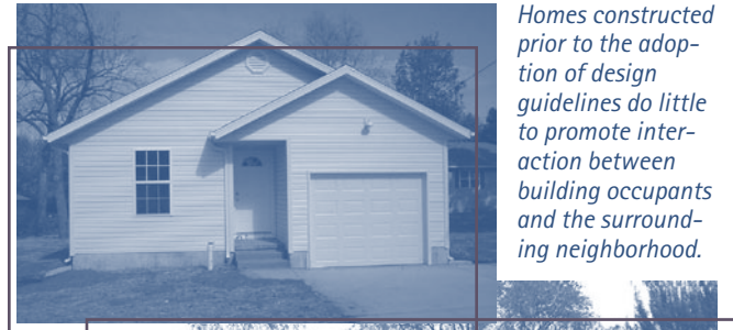
Homes constructed prior to the adoption of design guidelines do little to promote interaction between building occupants and the surrounding neighborhood.

to the character of the surrounding neighborhoods. The result has been affordable housing units that clearly stand out from the crowd... but for all the wrong reasons. Residents expressed concern that these units would lower their property values and increase rental development/renter population.