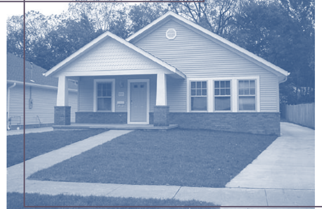
More recent design-driven homes incorporate elements, such as front porches and multiple window openings, that promote an inviting and engaging streetscape.

In the fall of 2002, the Springfield City Council responded by authorizing the use of basic design guidelines – the Residential Infill and Rehabilitation Guidelines (For Single-Family and Duplex Development) . The purpose of these basic Guidelines is to promote the rehabilitation and design of single-family residential and duplex developments located within established neighborhoods in a manner that's compatible with surrounding single-family housing styles, and to promote specific design elements that are beneficial to the health of affected neighborhoods.