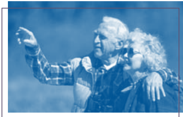
Seniors use reverse mortgages to help cover unexpected medical expenses and daily living expenses.

How much does it cost? Reverse mortgage costs are similar to those of conventional mortgages and include an origination fee, appraisal and inspection fees, title policy fee, mortgage insurance, and other closing costs. All of these costs can be financed as part of the reverse mortgage.